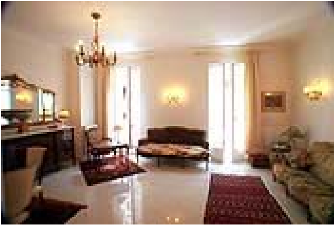
Lounge – Dining Room