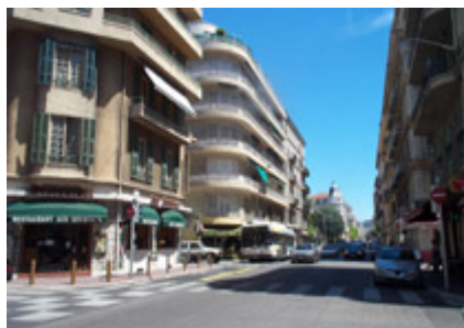
Rue Dante – 200m from Promenade des Anglais