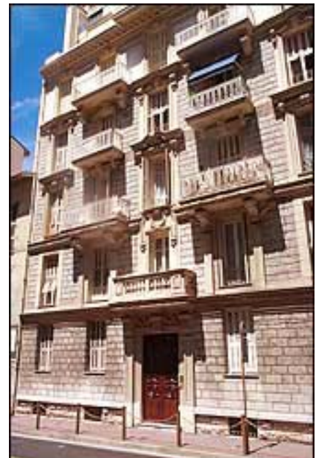
La Belle Epoque building