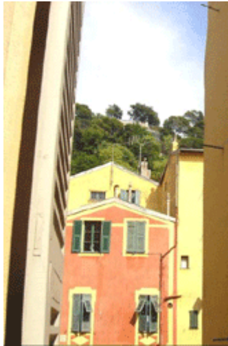
View of the Chateau Hill looking left from each bedroom window