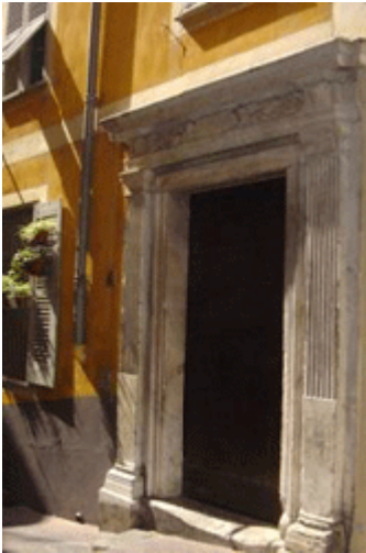
Majestic front door to the apartment building