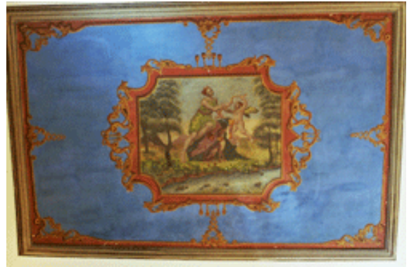
Fresco painting on the ceiling in the lounge. It is estimated to have been painted around 1750