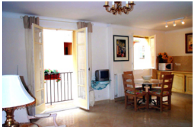
Looking towards balcony and dining area