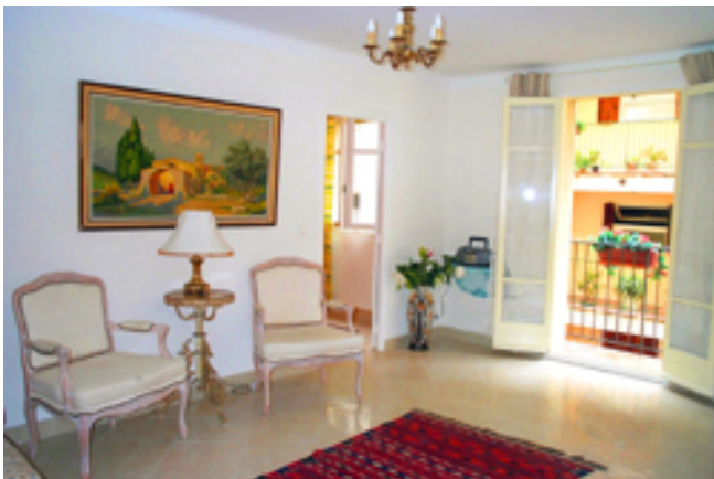
Looking towards balcony and bedroom